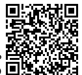
PIPER ECOLOGICAL TRAP DEMO VIDEO